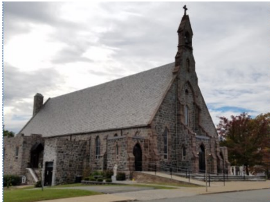
Our Lady of Mount Carmel School 205 Oak Street Boonton, NJ 07005