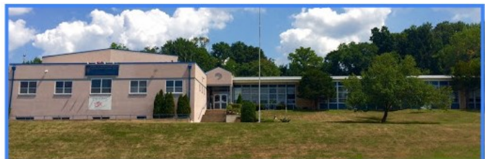
Immaculate Heart of Mary School 580 Ratzer Road Wayne, NJ 07470

This is a wonderful opportunity for all to meet the staff, tour the facility and see first-hand all they have to offer. All are welcome.