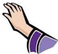
Anointing the sick